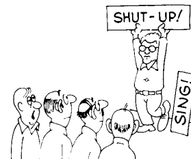
"Could he mean ME? I'm just trying to help."

Do you have a comment, suggestion or problem of which the board should be informed? Write a note and pass it on to any member-at-large. Handling such items is but one of the several tasks that these gentlemen have on their shoulders.